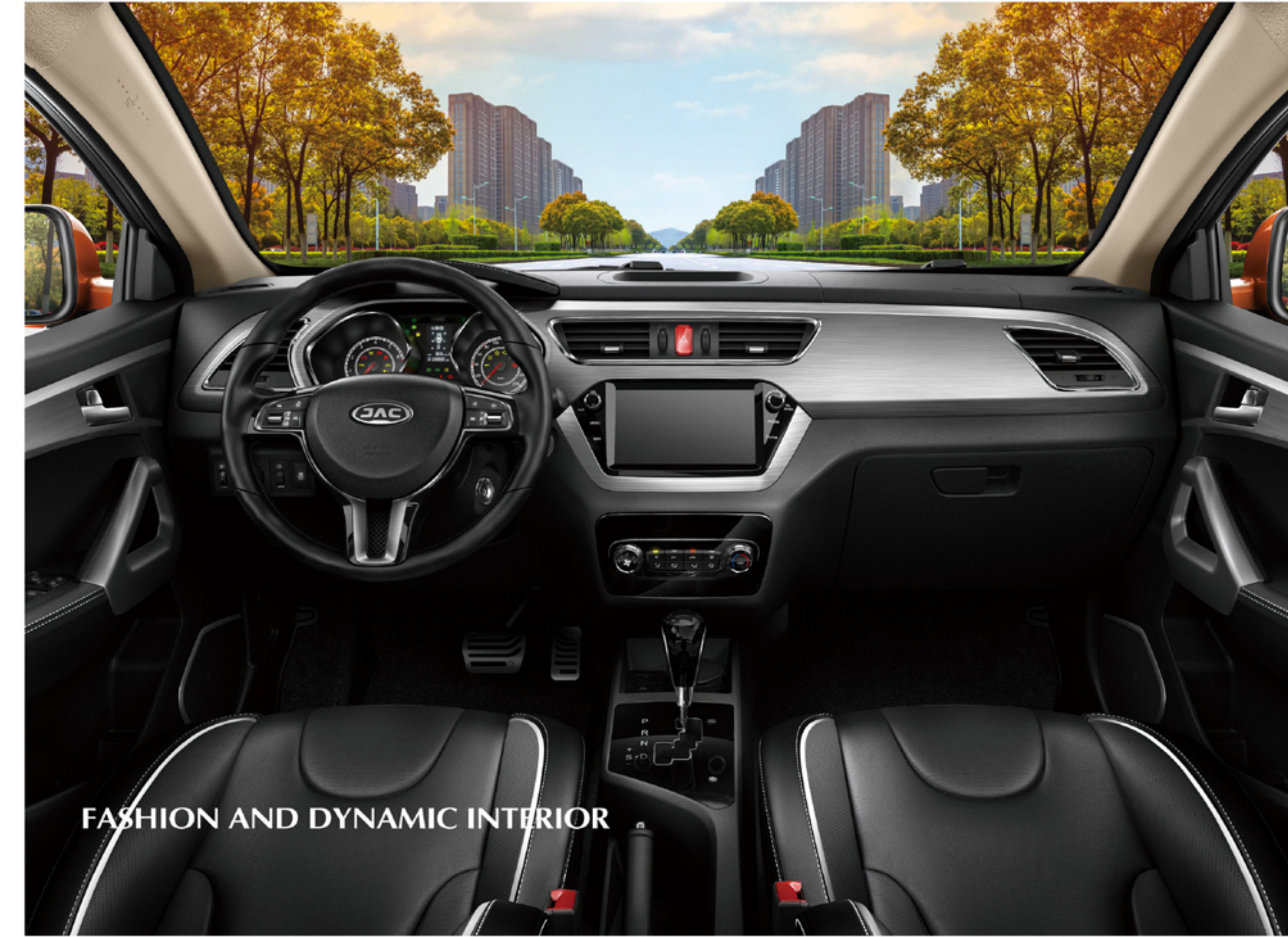
FASHION AND DYNAMIC INTERIOR