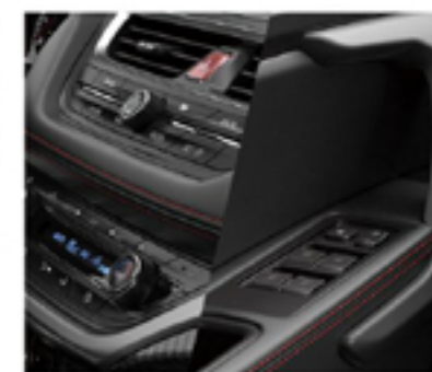
Soft Cover Central Console and Doors