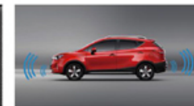
Front & Rear 8 Points Parking Sensor