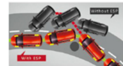
Electronic Stability Program