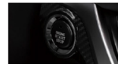
Passive Entry & Passive Start