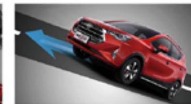
Hill Start Assistance