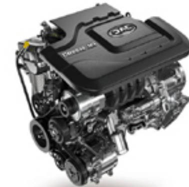
High Efficient 1.6L VVT Engine Euro V Emission Standard