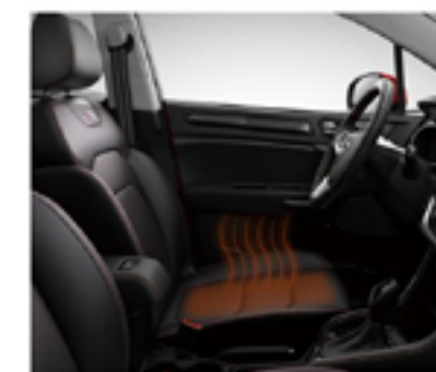
Driver Seat Heating