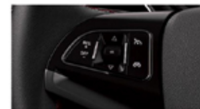
Cruise Control System